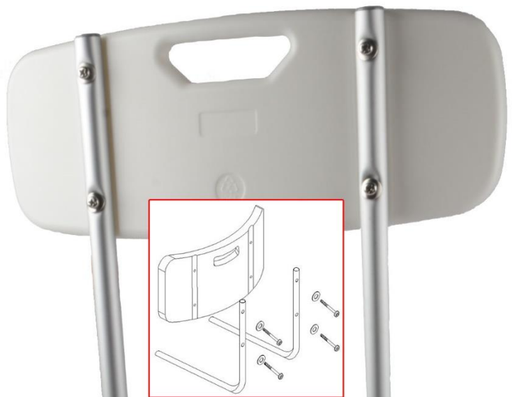
Step 3: Screw the backrest with 4 screws

Step 2: Reverse the seat first, cross 2 legs correctly then screw the crossed legs tightly in the central of reversed seat